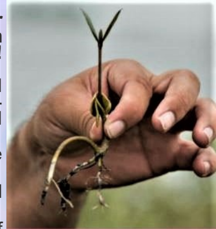
HELPING THE ENVIRONMENT